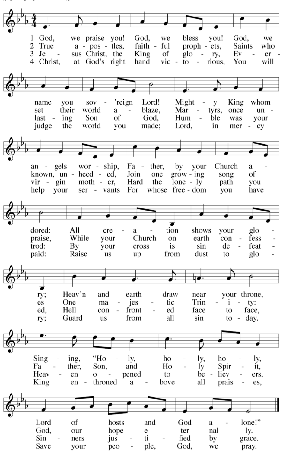
Text: © 1982 by Hope Publishing Co., Carol Stream II. 60188. All rights reserved. Used by permission. Tune and Setting: Public domain Reprinted under OneLicense.net #A-712488.